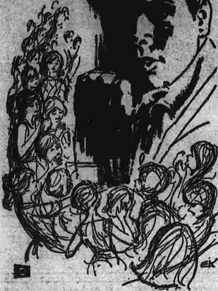
In "Teen-Age Idol," the trials and tribulations of a young show business personality are explored. The program traces the rocket-like career of Fabian, 20-year-old star of recording, movies and television. This segment of NBC-TV's "Hollywood and the Stars" series airs January 22.